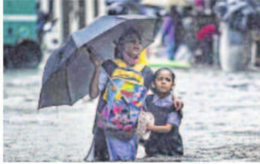
As incessant rains continue to lash Kerala with reports of landslides and rising river water levels in some parts of the state

Widespread incidents of water-logging in low-lying areas of villages and towns and uprooting of trees have been reported across