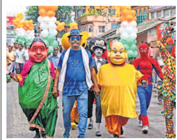
Trinamool Congress (TMC) supporters during a road show on the last day of the state panchayat election campaigning at Ahmadpur in Birbhum district