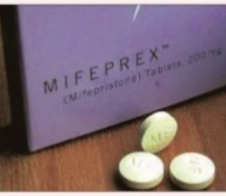
The lawmakers said in a letter to the FDA that the companies, primarily based in Europe, were distributing Mifeprex, a chemical abortion drug, by mail-order to US customers in violation of the FDA's safety protocols

LALIT K JHA Washington, May 15 A BIPARTISAN GROUP of 117 lawmakers has urged the US Food and Drug Administration (USFDA) to crack down on companies, primarily based in Europe, that ship chemical abortion drugs from India to the US.