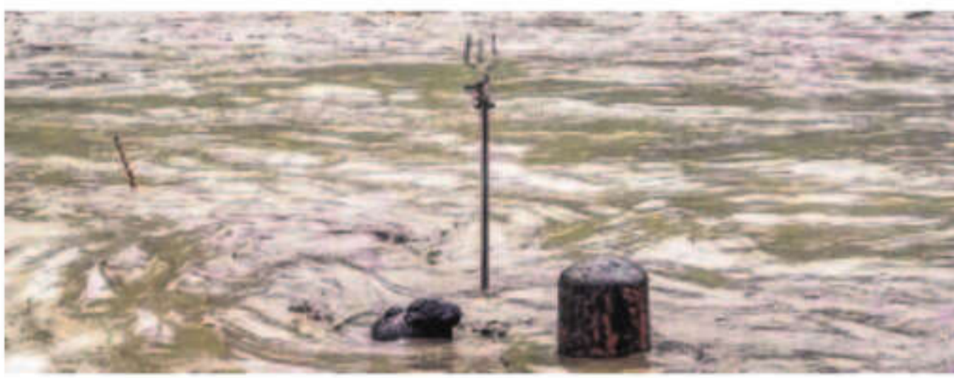
A view of the partially submerged Shivalinga and trident as a flood-like situation arise after the water level of Beas River rises due to heavy rains, in Mandi