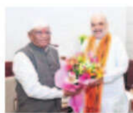
Amit Shah with Rajasthan Governor Haribhau Kisanrao Bagde

The governors of Rajasthan, Nagaland, Meghalaya and Goa met Union Home Minister Amit Shah here on Thursday.