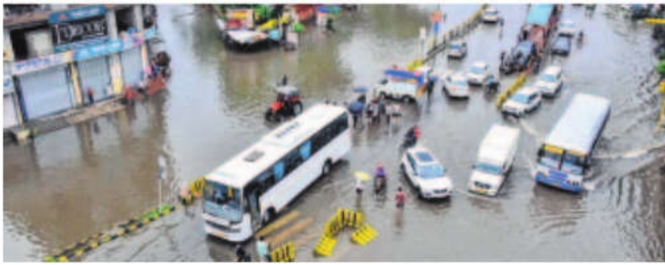
Commuters wade through a waterlogged road after rains, in Jaipur

The pilgrims stranded on the trek route to Kedarnath are being brought to an emergency helipad, Chief Minister Pushkar Singh Dhami said in a post on Facebook.