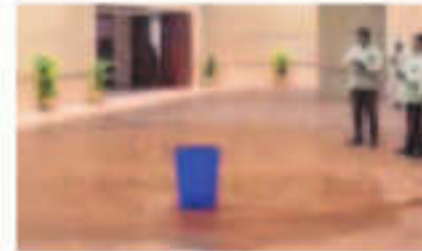
Screengrab from video shared by Manickam Tagore on X

water leakage inside. Recent water leakage in Parliament lobby used by the President highlights urgent weather resilience issues in the new building, just a year after completion."