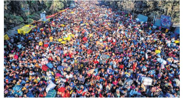
MASS GATHERING: Hindu devotees arrive for a holy dip at Sangamon the eve of the Mauni Amavasya or new moon day during Maha Kumbh festival on Tuesday