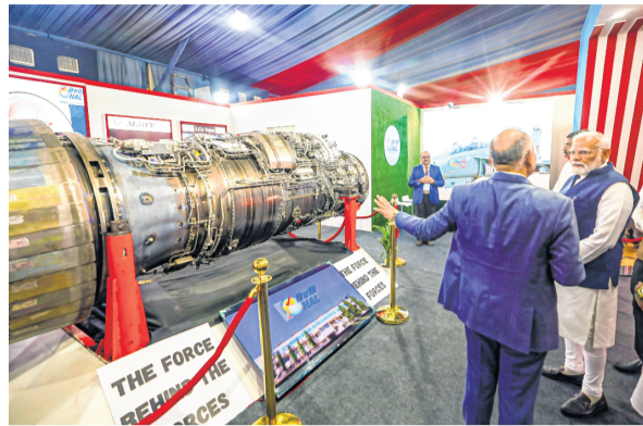
Prime Minister Modi at an exhibition during the Utkarsh Odisha Conclave in Bhubaneswar on Tuesday

"Odisha is outstanding and it is the symbol of optimism and